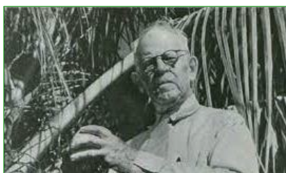
DAVID FAIRCHILD "America's Top Food Spy"

American supermarkets were not always abundant and diverse as they are today. At the turn of the 20th century, David Fairchild and his team of USDA botanists circled the world in search of novel plants—and in turn, they transformed the American diet. Avocados from Chile, mangoes from India, seedless grapes from Italy, and much more. Join their adventures with National Geographic writer Daniel Stone, author of The Food Explorer: The True Adventures of the Globe-Trotting Botanist Who Transformed What America Eats .