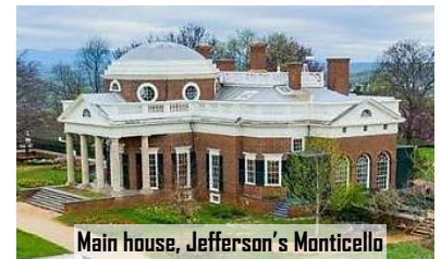
Main house, Jefferson's Monticello

The success of Newtonian physics in providing a mathematical description of an ordered world clearly played a big part in the flowering of the Enlightenment , the idea of order and rationality as a way to investigate the world having taken root and seeming the obvious way forward.