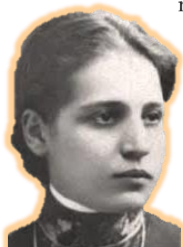
LISE MEITNER 1878 – 1968

The story is one of genius and dishonesty. Lise Meitner's extraordinary relationships raise questions of loyalty and betrayal. Fear, injustice, discrimination, and misogyny are parts of the story of the young Viennese woman, Lise Meitner, for whom the study of physics was the battle for ultimate truth about our universe ... and ultimately about ourselves.